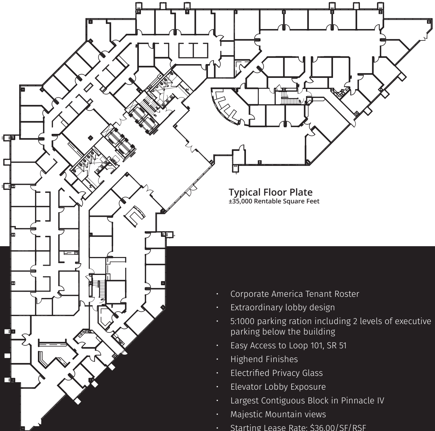
Typical Floor Plate ±35,000 Rentable Square Feet